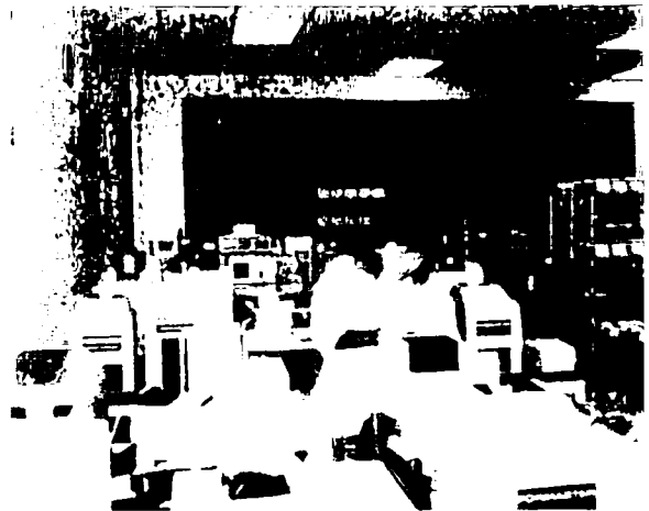
Automated duplicating equipment produce 30,000 disks per day.

DisCopyLabs expects to see more activity in fulfillment as customers use this service. The expansion of fulfillment services is another way that DisCopyLabs provides customers with a one-stop production service.